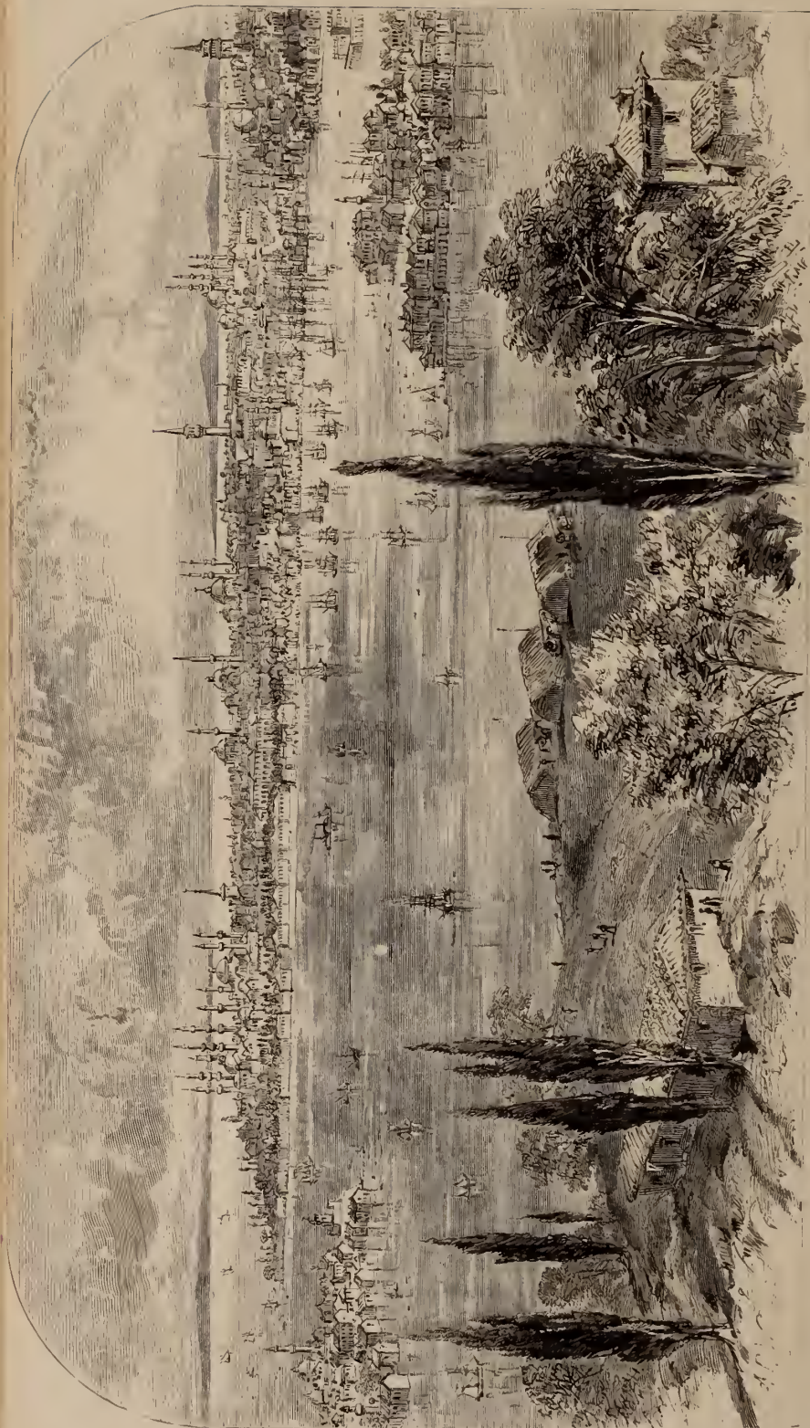
VIEW OF CONSTANTINOPLE.